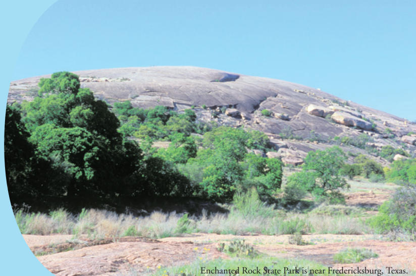
Enchanted Rock State Park is near Fredericksburg, Texas.

This billion-year-old batholith is a reminder that you can be around long time!